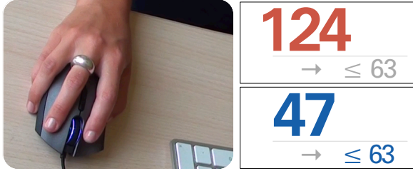
Figure 2: Physical layout (left) and display for failed (top-right) and successful (bottom-right) trials.

completion, a message indicating whether the trial was successful or not was displayed for 750 ms, after which the instructions for the next trial were automatically presented.